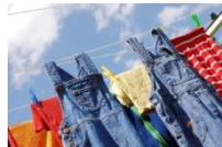
CLOTHING & HOUSEHOLD ITEMS

Accepts Christmas trees during regular curbside pick-up in Jefferson Parish. Call for information on drop-off donations.